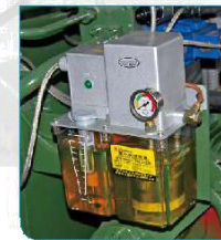
Central electric lubrication system