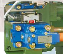
Low pressure mould protecting system