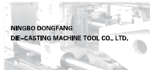
NINGBO DONGFANG DIE-CASTING MACHINE TOOL CO., LTD.