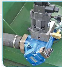
Adopting pumps and valves of world famous brand