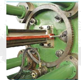
Hydraulic drive planetary gear mold-adjust device