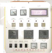
Special touchscreen for imported die casting machine