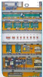
Adopting computers and contactors of world famous brand