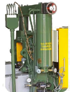
Unique quick injection control system