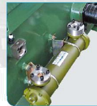
Large flow cooling system and precise oil filter