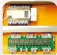
Adopting computers and contactors of world famous brand