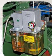
Central electric lubrication system