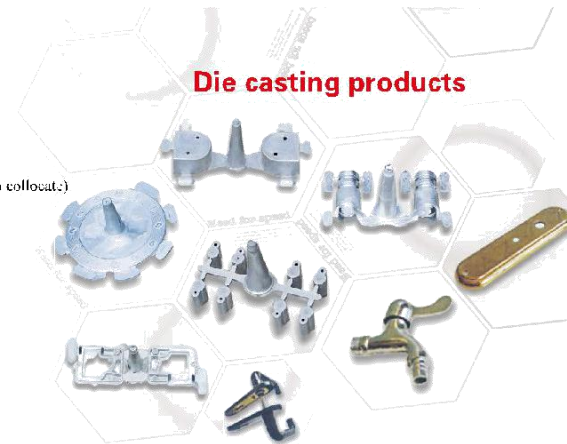
Die casting products