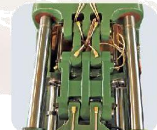
Solid mold frame system