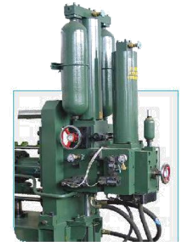
Unique design infection control system